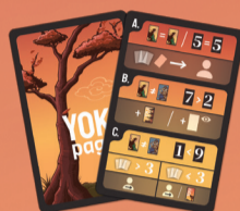
5 summary cards