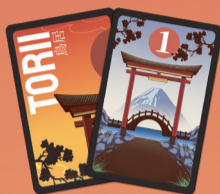
4 Torii Gate cards