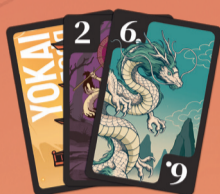
100 Yokai cards (10 for each Yokai type)