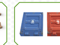
2 storage boxes