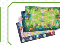
4 boards (8 Terrains)