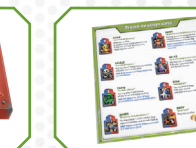
1 player aid