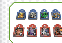
48 Troop tiles