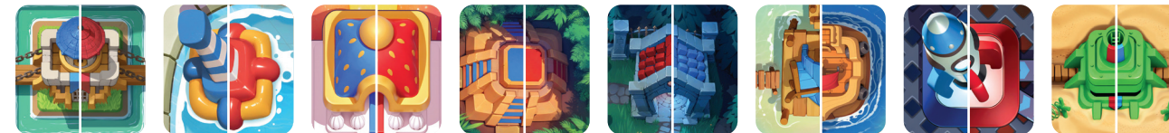
Castle Field Tropical Pool City of Clouds Volcanic Jungle Cursed Cemetery Caribbean Sea Station Metal-X Battlefield