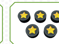
16 Medal markers