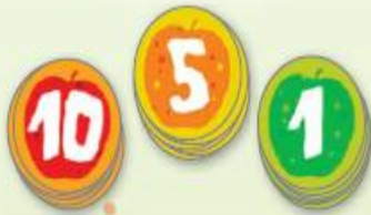
36 Point Tokens