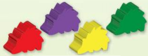
4 Hedgehog Figures